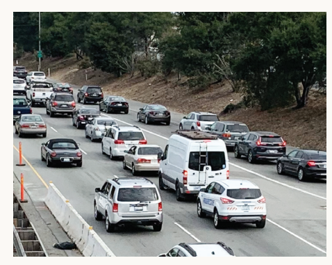
Insignificant Highway 1 traffic reduction (1.7%). On neighborhood streets, traffic would increase due to train crossings.